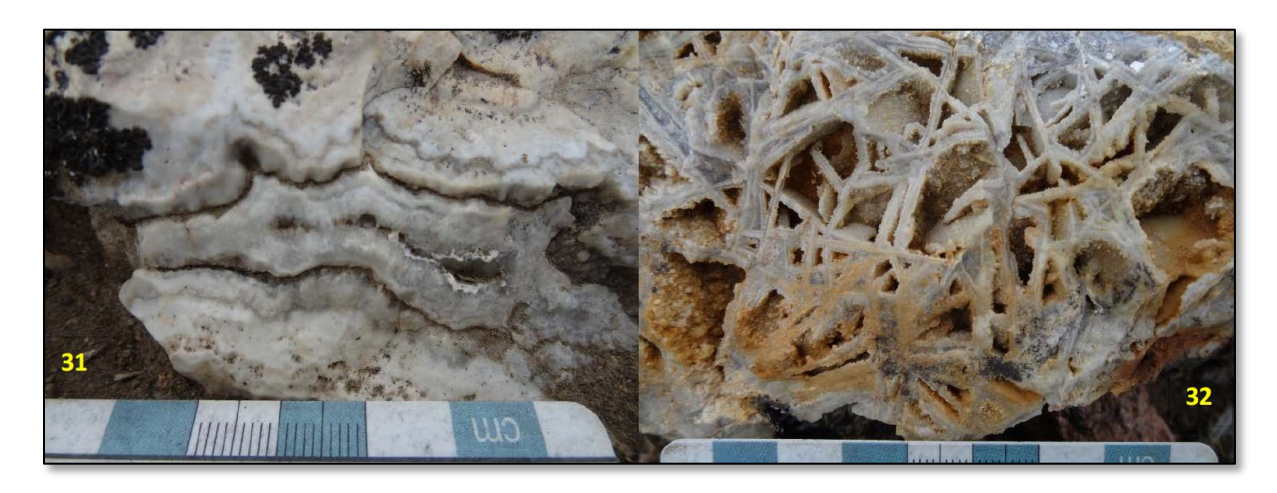
Plate 1: La Flora West Zone. Photo 31 - banded crustiform-colloform, crystalline-chalcedonic quartz vein. Photo 32 - Crystalline quartz replacing bladed calcite/barite

The La Flora property is approximately 50 square kilometers in area. The East Zone of mineralization is characterized by a prominent ridge and upstanding linear silicified structures. A second sub-parallel structure was observed 100m to the west. The West Zone ( Plate 1 ) is characterized by a vein accompanied by an anastomosing network of narrow veins, with sub-crop and float of epithermal quartz vein material.