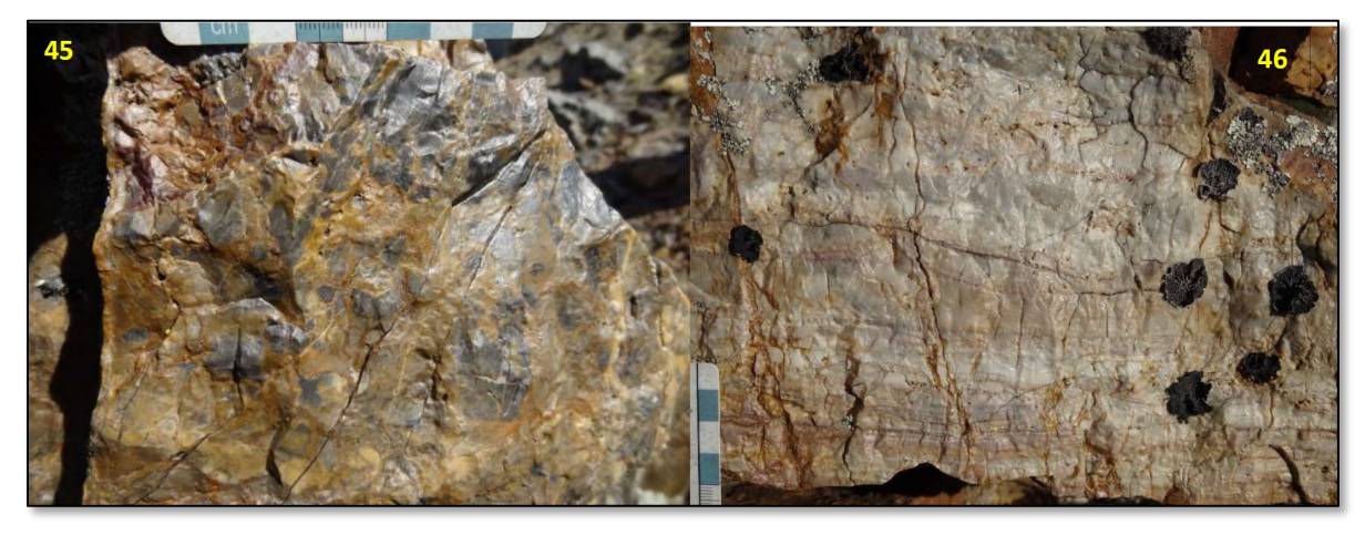
Plate 2: Los Amigos Zone. Photo 45 – massive and brecciated chalcedonic-microcrystalline silica. Photo 46 – fine-bedded chalcedonic-microcrystalline silicified tuff or sediments.

The Cerro Bayo project is approximately 80 square kilometres in area. The higher priority Amigos Zone is characterized by outcrops of silicified rhyolite with fine-grained, crystalline drusy quartz associated with illite-sericite alteration, together with silicified structures and chalcedony veins. A prominent summit comprises a preserved silica cap with common jarosite and haematite.