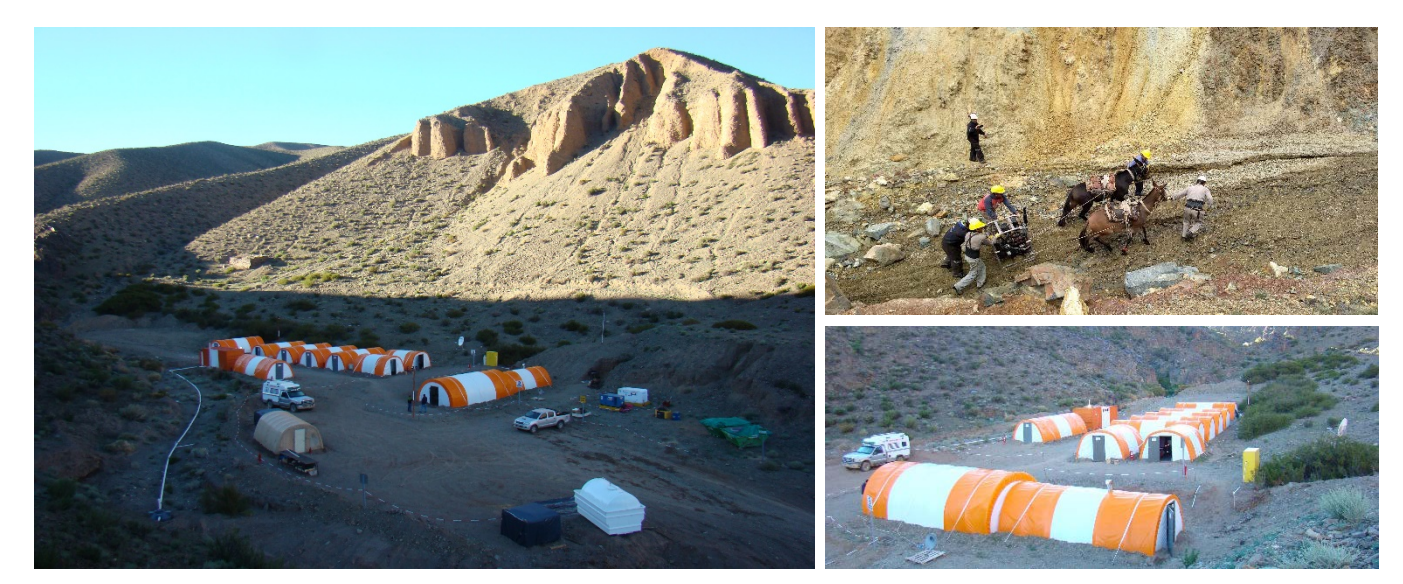
Figure 2: Photographs of the drill camp and mobilization of drill equipment using low-impact mules.

Figure 1: Map showing location of existing drill holes at Esperanza (blue, 2007) & the first new hole (red, 2018). The location of recently discovered mineralization (95m horizontal distance) is highlighted and labelled. Some of the best mineralization to date has been intersected at the Canyon and Oro Rico Stocks. New mineralization suggests that the Canyon Stock extends southeast.