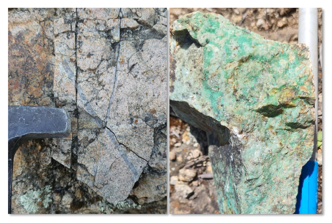
Plate 1. Typical porphyry B-type veins in outcrop (left) and outcropping copper oxide mineralization (right) from within the core area of high-grade mineralization (shown on Figure 1).

"Ongoing rock sampling results from Auquis continue to expand the footprint of copper mineralization on the project with the core area expanded by more than 100% as a result of recent exploration," stated Keith Henderson, Latin Metals' President & CEO. "The project has potential scale and grade, which are important ingredients required to secure a future partner."