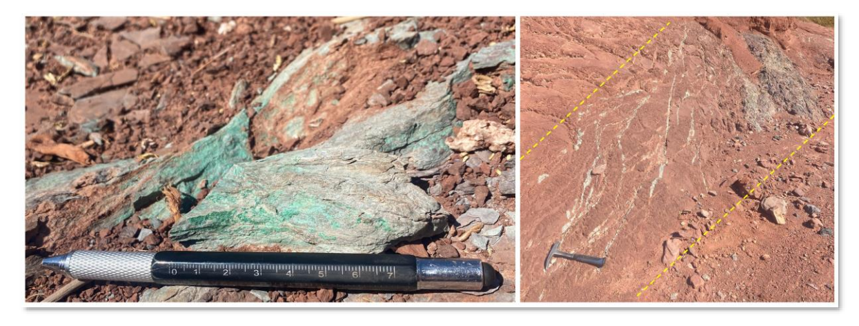
Figure 1: Newly discovered outcropping sediment-hosted copper mineralization at Mirador. Yellow dashed lines indicate minimum stratigraphic thickness of mineralization. Recent alluvial sediment obscures the geological boundary.

The recent mapping of additional outcropping copper mineralization builds upon this success, reinforcing the validity of the company's exploration thesis. Exploration at Mirador began last month and it is planned that the property will be systematically covered by drainage sampling and prospecting. At this early stage the Company's geologists have only walked over approximately 10% of this very large property and so it is encouraging to have already located additional outcropping copper mineralization. ( Figure 1 )